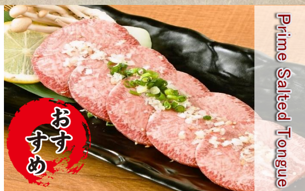
Prime Salted Tongue