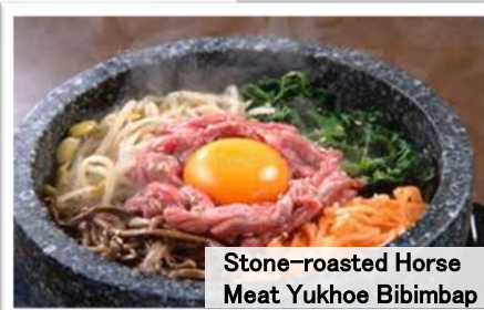
Stone-roasted Horse Meat Yukhoe Bibimbap