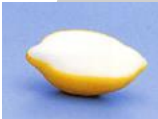
Lemon Sorbet 450yen (495yen)