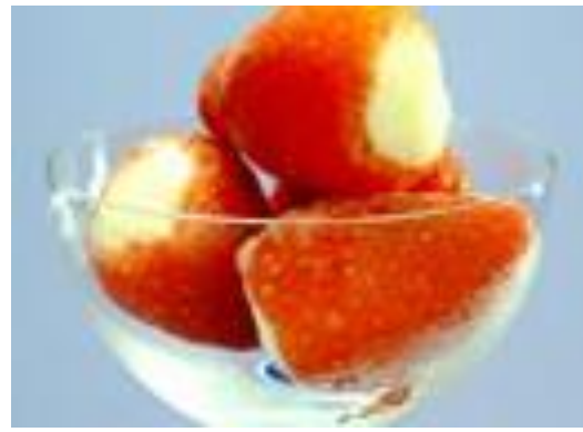
Strawberries 450yen (495yen)