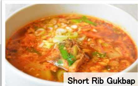
Short Rib Gukbap