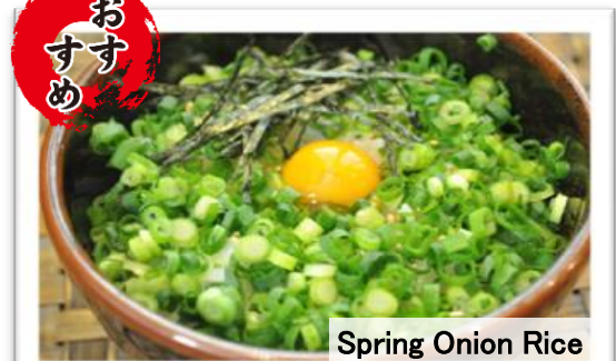
Spring Onion Rice