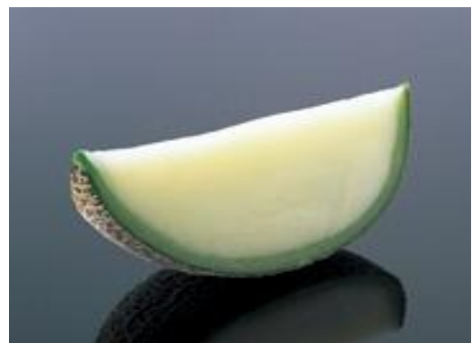
Melon Sorbet 650yen (715yen)