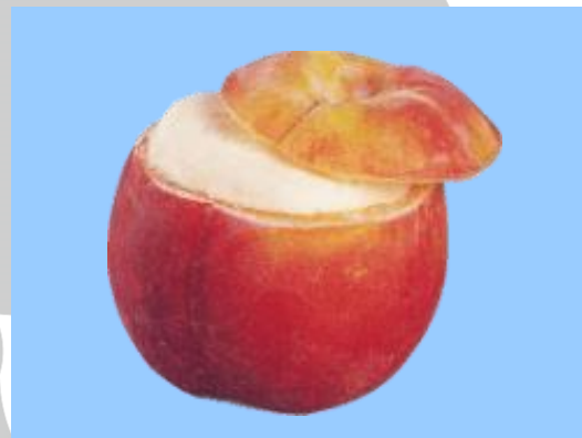
Whole Peach Sorbet 690yen (759yen)