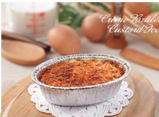
Cream Brulee Custard Ice Cream 480yen (528yen)