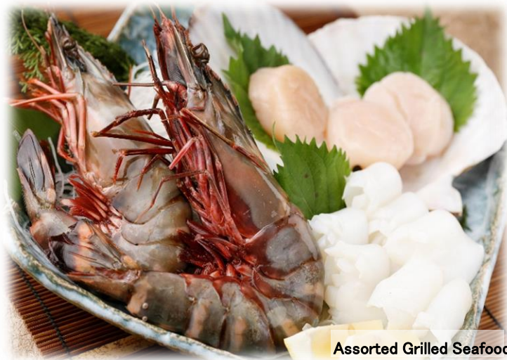
Assorted Grilled Seafood