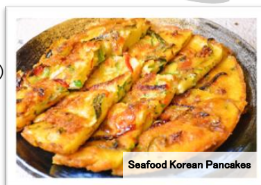
Seafood Korean Pancakes