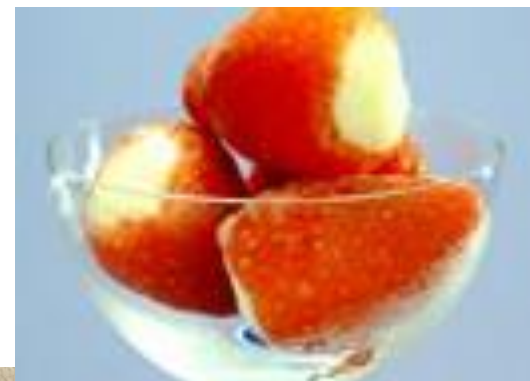
Strawberries 450yen (495yen)