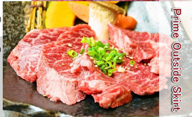
Prime Outside Skirt