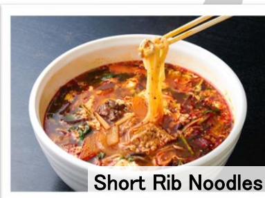
Short Rib Noodles