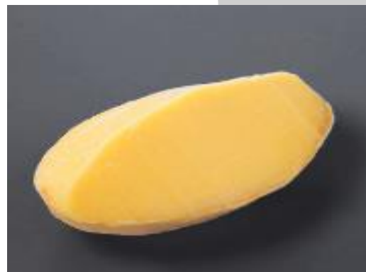
Mango Sorbet 580yen (638yen)