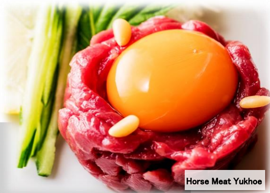
Horse Meat Yukhoe

Ikafe 850yen (935yen) (Korean Spicy Raw-Squid )