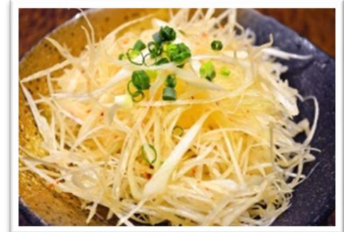
Negi-munchi (Recommended with meat!)