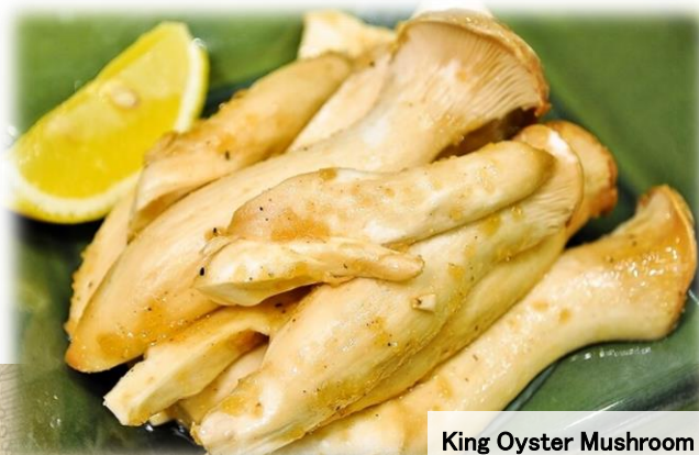
King Oyster Mushroom