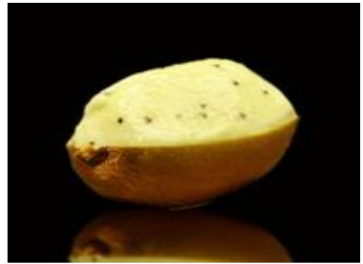
Kiwi Sorbet 450yen (495yen)