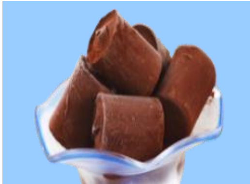
Ganache Ice Cream 450yen (495yen)