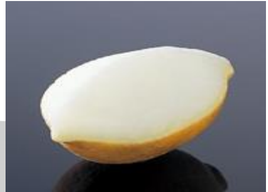
Lemon Sorbet 450yen (495yen)