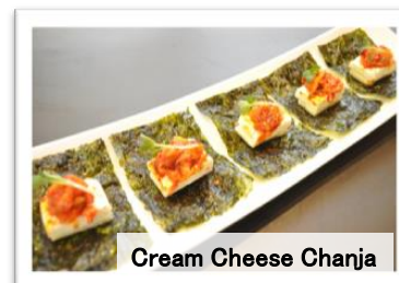
Cream Cheese Chanja