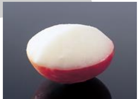
Peach Sorbet 600yen (660yen)