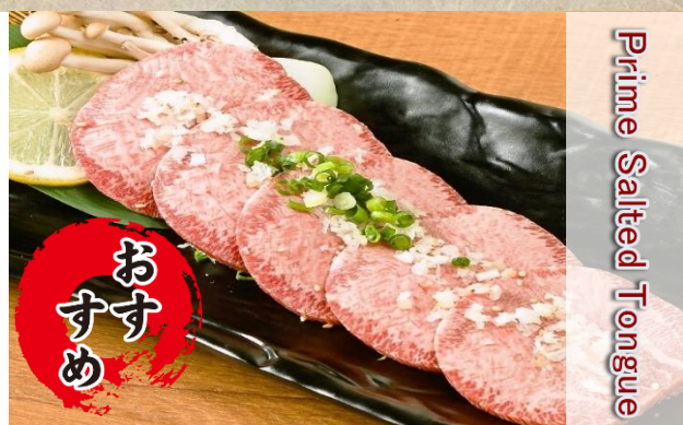
Prime Salted Tongue