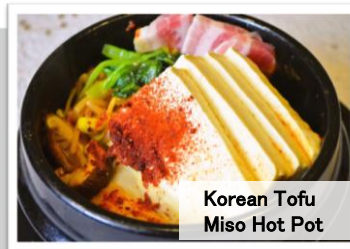
Korean Tofu Miso Hot Pot