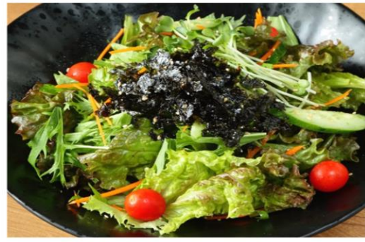
Korean Style Choregi-salad