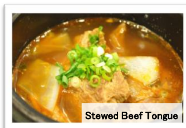
Stewed Beef Tongue