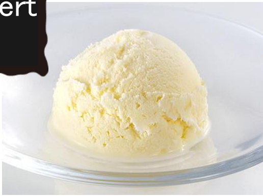
Vanilla Ice Cream 380yen (418yen)